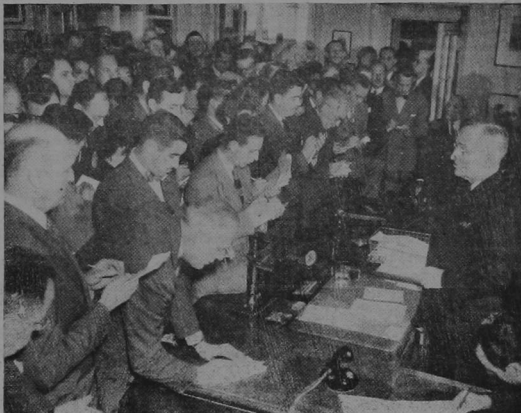
En su despacho de la Casa Blanca el Presidente Harry S. Truman celebra su primera entrevista con los corresponsales de la prensa del país. El Presidente puso de manifiesto una vez más que seguirá la política iniciada por Franklin Delano Roosevelt e hizo hincapié en la necesidad inmediata en un organismo mundial para mantener la paz.